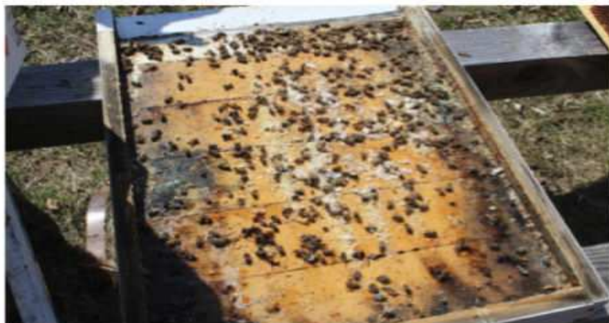
Figure 3. Picture of the bottom board taken from one of the dead neonicotinoid-treated colonies on March 1 st , 2013. The numbers of dead bees in the six dead CCD colonies ranged from 200-600 dead bees.

As noted above, the study claimed "The absence of dead bees in the neonicotinoid-treated colonies..." This statement is contradicted by Figure 3 which states there were from 200 to 600 dead bees on the bottom boards of the neonicotinoid-treated hives. There is no mention of whether or not there were dead bees in the clusters in the frames or around the exteriors of the hives.